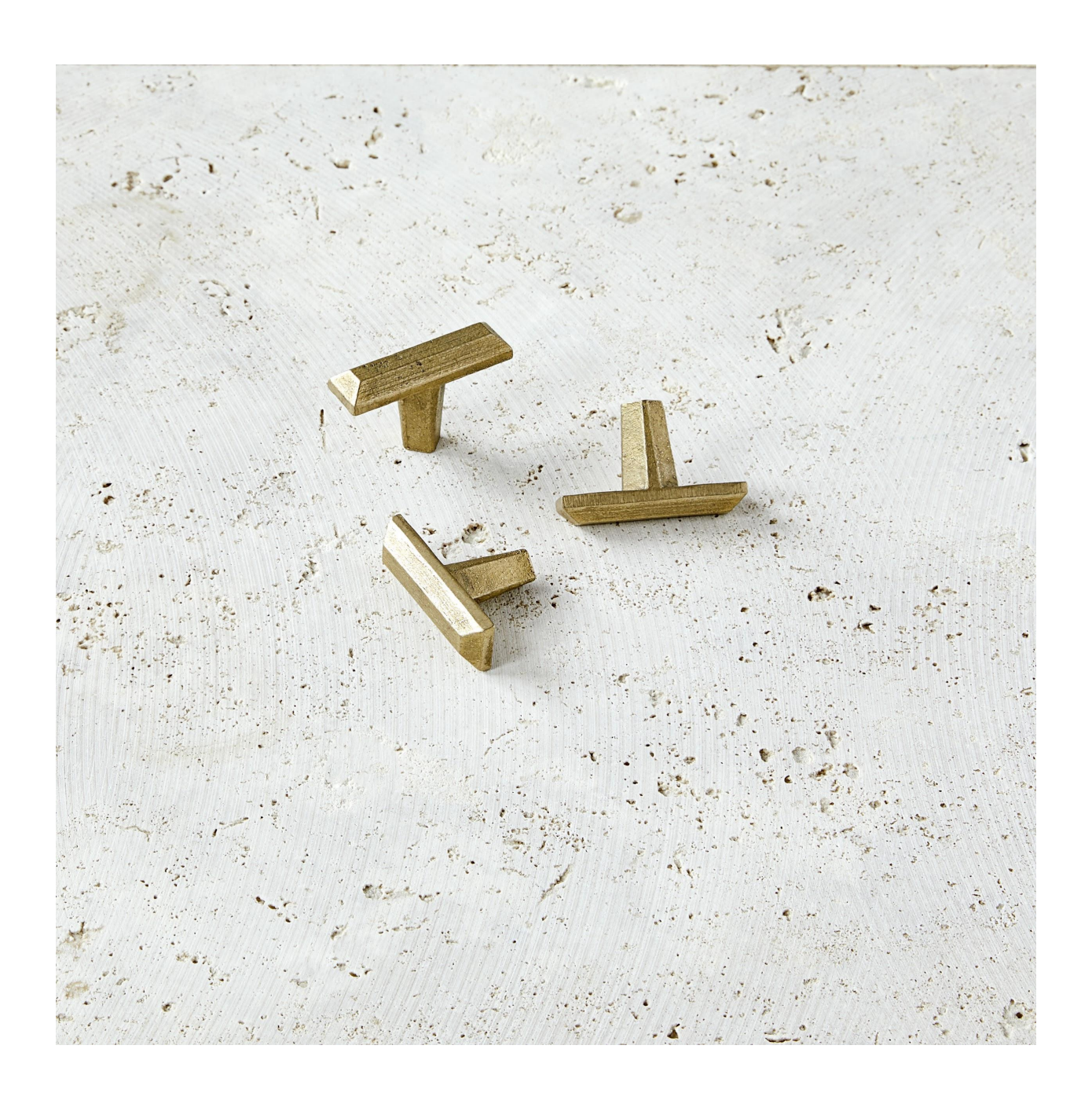
PYRA 2" handle/hook.