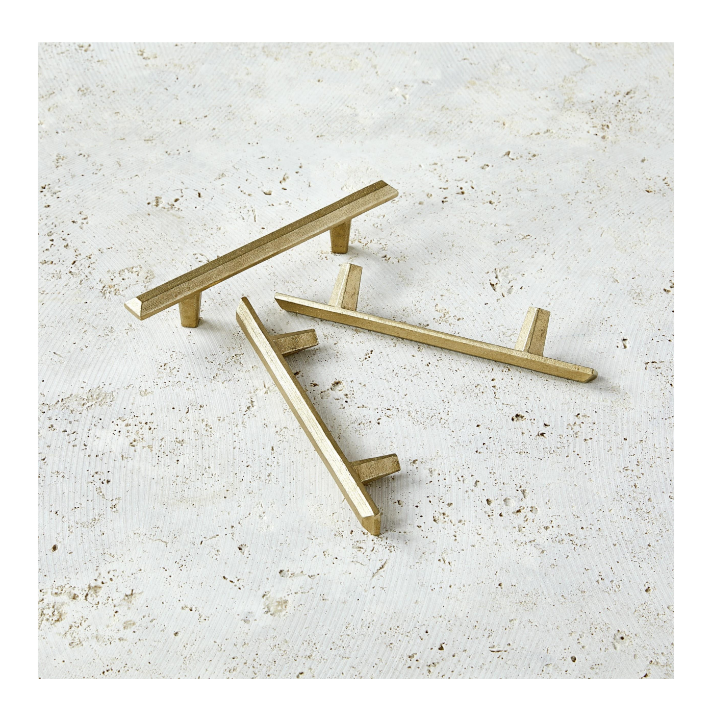
PYRA 7" handle.