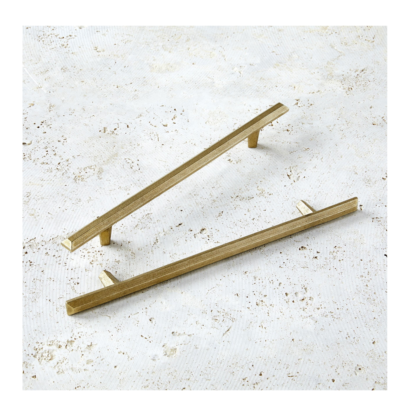
PYRA 12" handle.