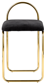
Colour Anthracite / Gold Art. No. 501599000081