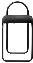
Colour Anthracite Art. No. 501590065081