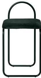
Colour Forest Art. No. 501590564081