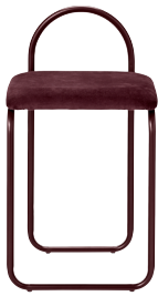
Colour Bordeaux Art. No. 501590244081