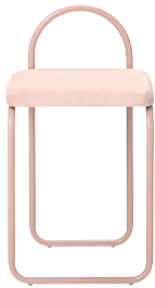
Colour Rose Art. No. 501590849081