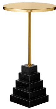
Colour Gold / Black Art. No. 500799000012