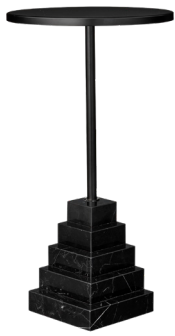
Colour Black Art. No. 500790050012